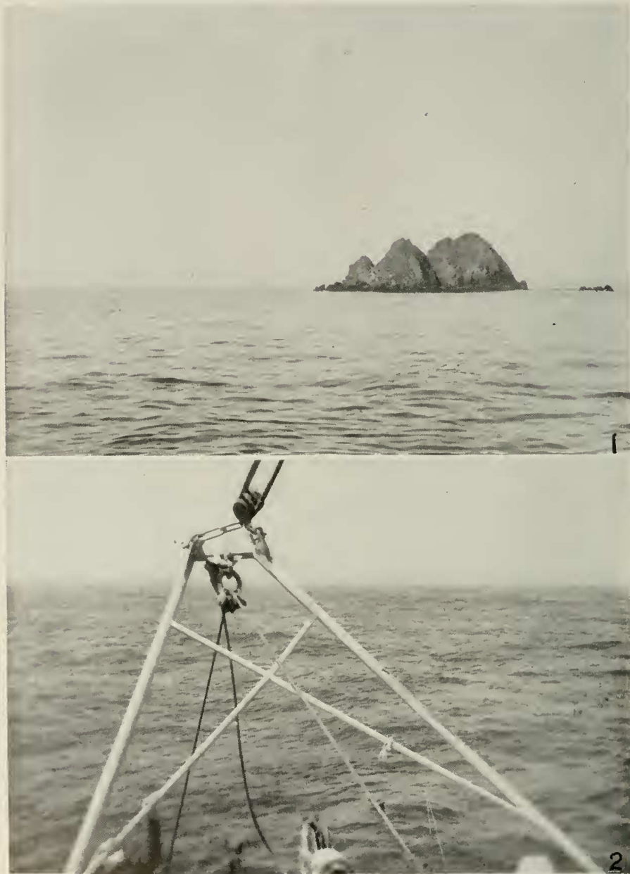
Figure 1. North Farallon Rocks as seen from the northeast. There are five main rocks and several smaller ones.